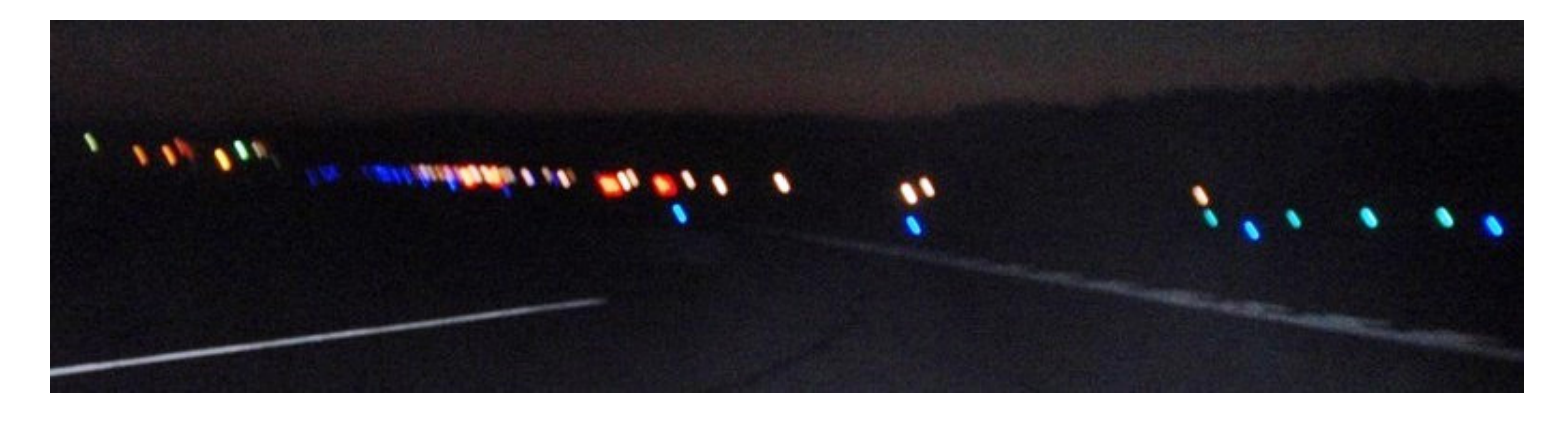
It was a wonderful night flight but my camera cannot capture the awesome sights we saw below