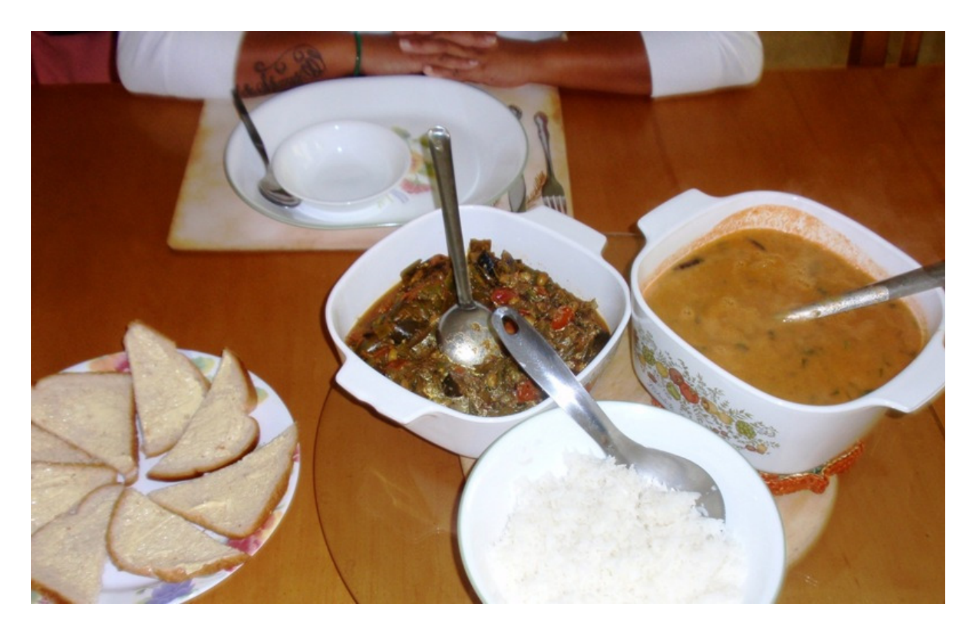
A special flavored bread pre cut and buttered, a veggie medley prepared with curry, a tan/orange homemade lentil soup prepared with curry, and fluffy white rice. This was so cool for a mid-western raised boy to experience. (Cool was an anti-pun). Curry is quite hot in the spice ranking.