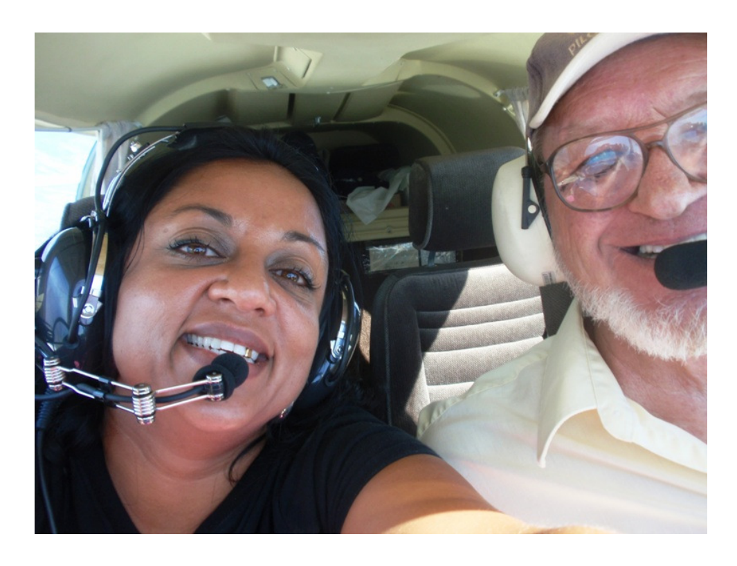
Soni took this one of us in flight