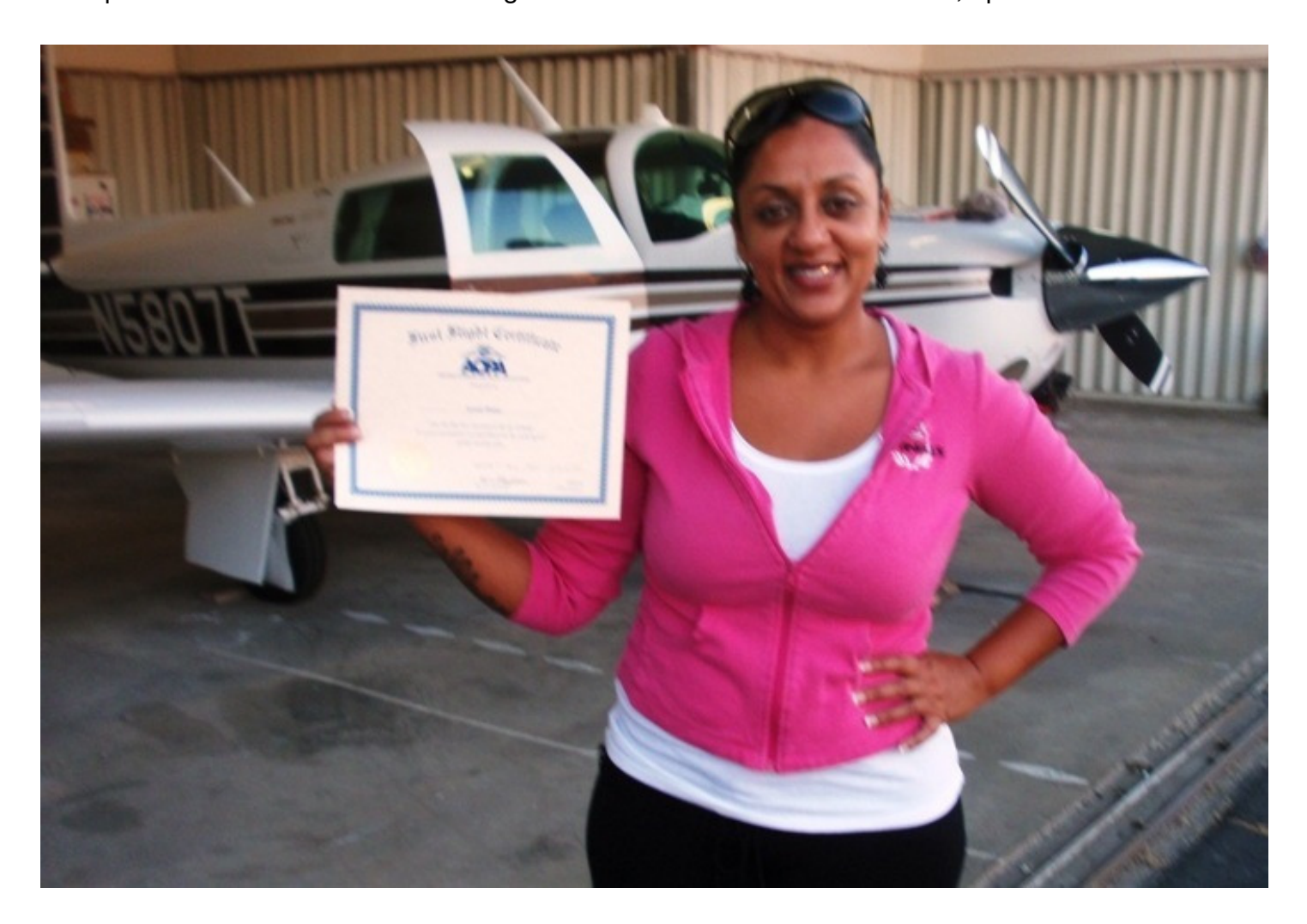
She was wearing pink over black that day

Eight days later we met again on a Monday around 7 after work. As I recall, she looked just stunning in heels and a beautiful wispy beige and brown dress. She had come from and interview and had intended to change somewhere before going flying. I had her grab her comfy clothes from her car, suggested she go in my hangar, showed her where the light switch was and then I closed the hangar doors. Perfect changing room. When she emerged, I had a surprise for her. Our first flight together had qualified her for an AOPA First Flight Certificate. So before we took off, I presented it to her.